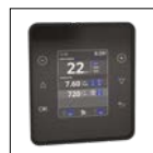
Detachable TFT screen