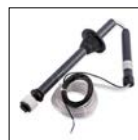
Empty Tank detection