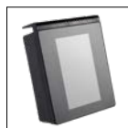
Detachable touch screen